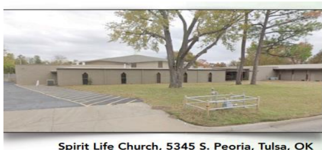
Spirit Life Church, 5345 S. Peoria, Tulsa, OK