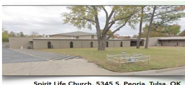
Spirit Life Church, 5345 S. Peoria, Tulsa, OK