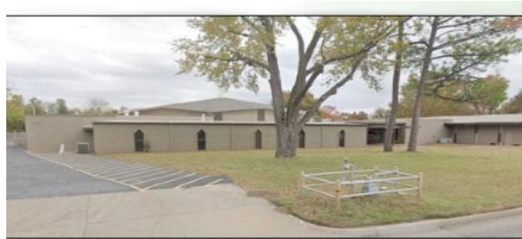
Spirit Life Church, 5345 S. Peoria, Tulsa, OK