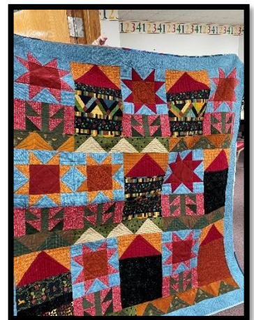
Hearts and Hands Donated Quilt